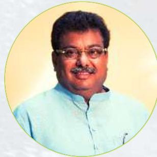
SHRI. M B PATIL HON'BLE CHANCELLOR